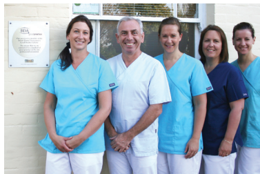
East Street Dental Practice, Andover

“I would strongly commend membership of BDA Good Practice to all GDPs, certainly as an aid to CQC compliance but most importantly as a means to ensuring that their practice is seen to be demonstrating a commitment to nationally recognised standards and developing a quality service for patients.”